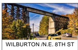
WILBURTON / N.E. 8TH ST

The Wilburton Land Use Code Amendment (LUCA) – is slated for approval by the end of April and adopted in late June.