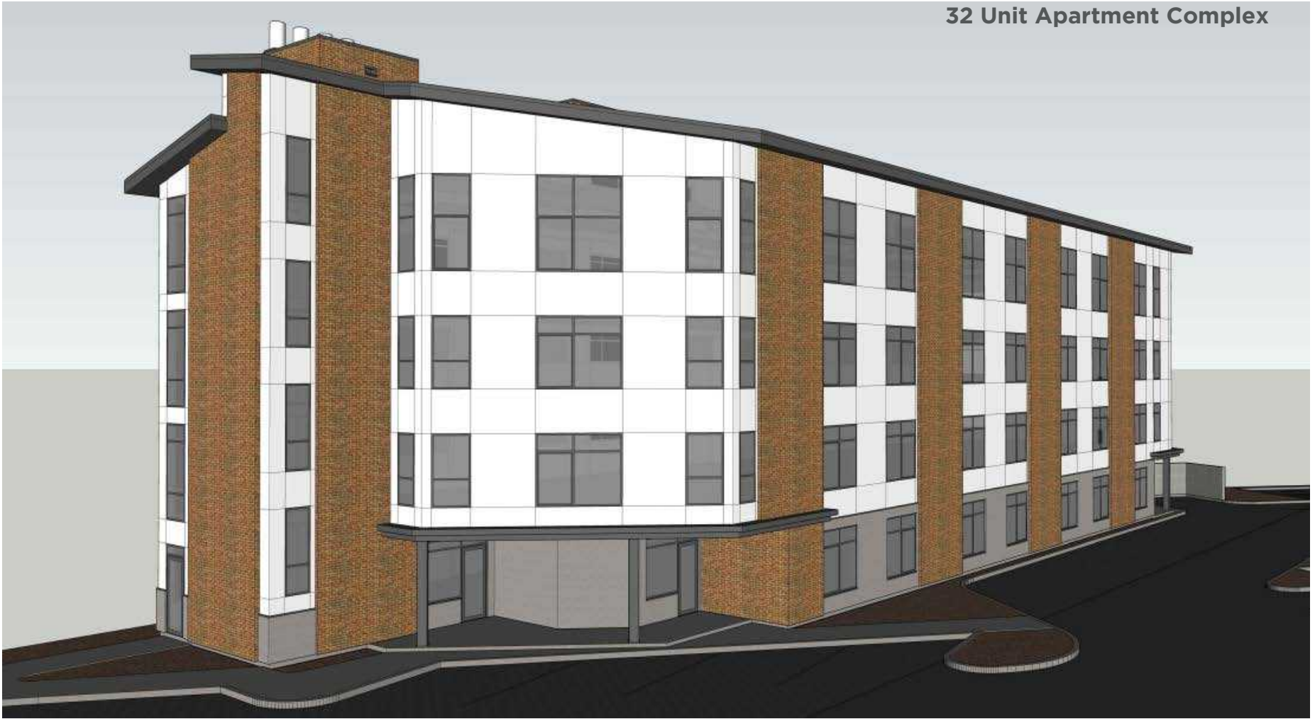
32 Unit Apartment Complex

University Gateway is mixed-use development totaling 123,000 SF of residential and retail space. The 2.49 acre project is located adjacent to the intersection of Deakin and 6th street, the single most traveled pedestrian corridor between the University of Idaho and downtown Moscow. The project offers the buyer the opportunity to recover a portion of their investment in the short-term through the resale of 27 townhome lots, while simultaneously securing long-term cash flow and market appreciation with the development of 92 rental apartments and up to ten retail suites. The project is fully entitled.