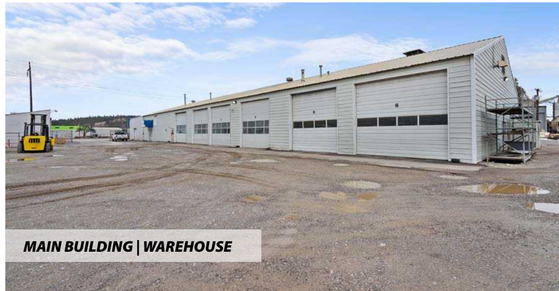
MAIN BUILDING | WAREHOUSE