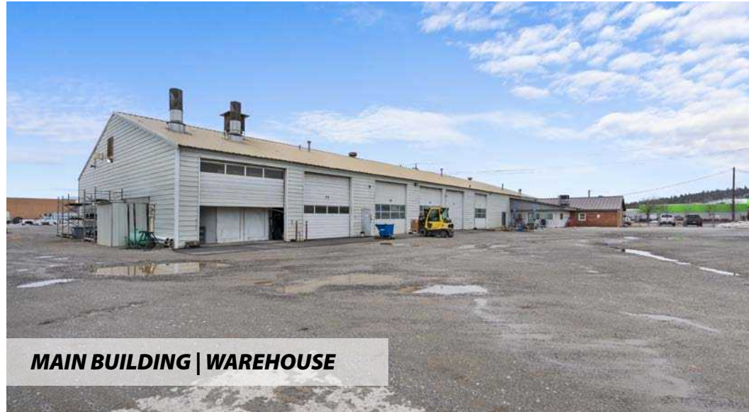
MAIN BUILDING | WAREHOUSE