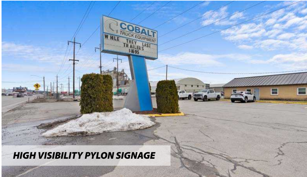
HIGH VISIBILITY PYLON SIGNAGE