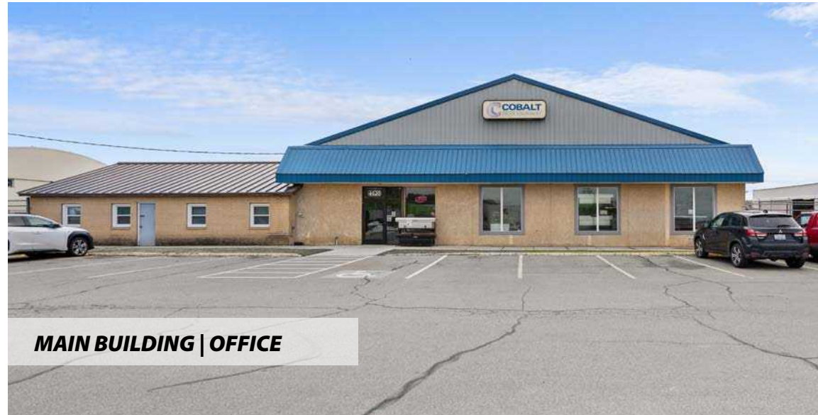
MAIN BUILDING | OFFICE

DREW ULRICK 509.435.5866 drew@tokcommercial.com