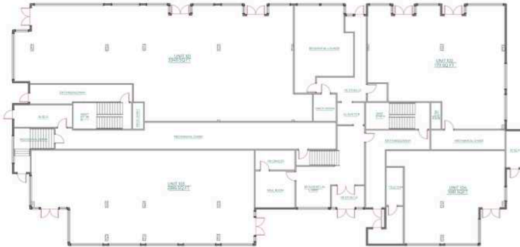
GROUND FLOOR SPACES