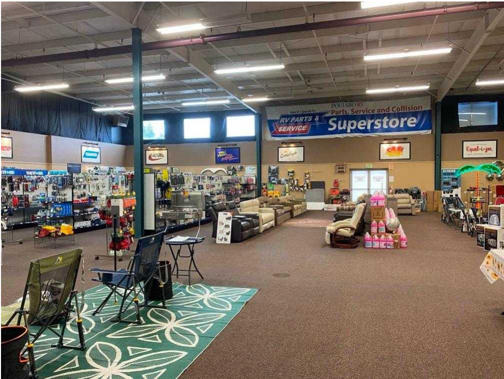
Parts Sales / Retail