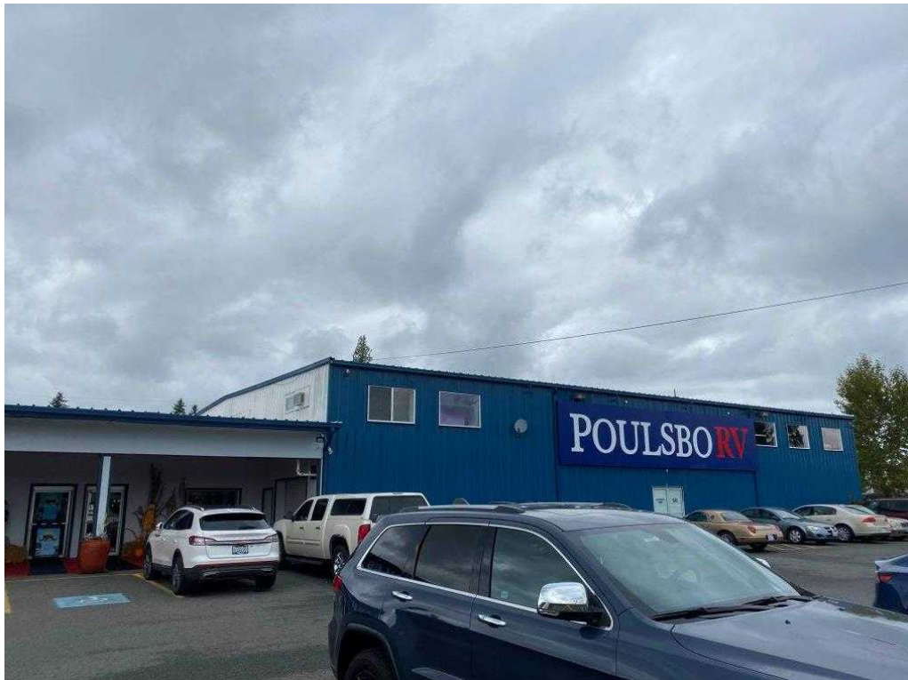
Exterior / Sales / Showroom Building

The information supplied herein is from sources we deem reliable. It is provided without any representation, warranty or guarantee, expressed or implied, as to its accuracy. Prospective Buyer or Tenant should conduct an independent investigation and verification of all matters deemed to be material, including, but not limited to, statements of income and expenses. CONSULT YOUR ATTORNEY, ACCOUNTANT OR OTHER PROFESSIONAL ADVISOR.