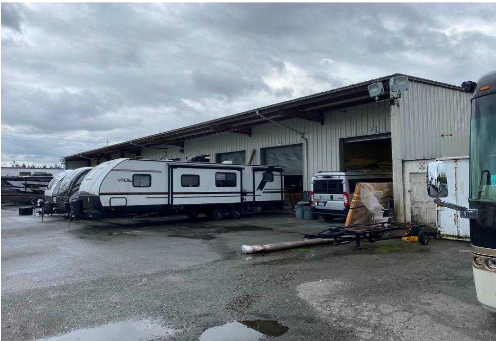
Service Building / Exterior

The information supplied herein is from sources we deem reliable. It is provided without any representation, warranty or guarantee, expressed or implied, as to its accuracy. Prospective Buyer or Tenant should conduct an independent investigation and verification of all matters deemed to be material, including, but not limited to, statements of income and expenses. CONSULT YOUR ATTORNEY, ACCOUNTANT OR OTHER PROFESSIONAL ADVISOR.