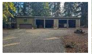
OPEN VEHICLE STORAGE BUILDING