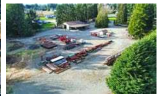
FENCED CONTRACTOR YARD