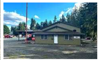
SHOP & OFFICE BUILDING