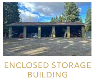
ENCLOSED STORAGE BUILDING