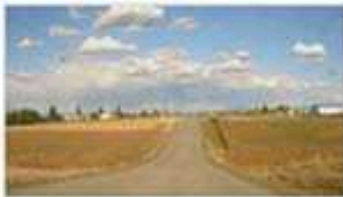
A rural scene north of Airway Heights looking east

Airway Heights is located at 47°38′37″N 117°35′11″W ﻿ / ﻿ 47.643648, -117.586491 ﻿ / 47.643648; -117.586491 . [8] Downtown Spokane is located eight miles by road east of Airway Heights. In 2012, the City of Spokane incorporated the Spokane International Airport and surrounding area, [9] since which the city Spokane has bordered the city of Airway Heights to the east and south. [10]