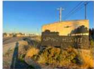
Welcome to Airway Heights sign on U.S. Route 2