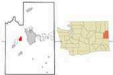
Location of Airway Heights, Washington Coordinates: 47°38′37″N 117°35′11″W ﻿ / ﻿ 47.643648, -117.586491 ﻿ / 47.643648; -117.586491