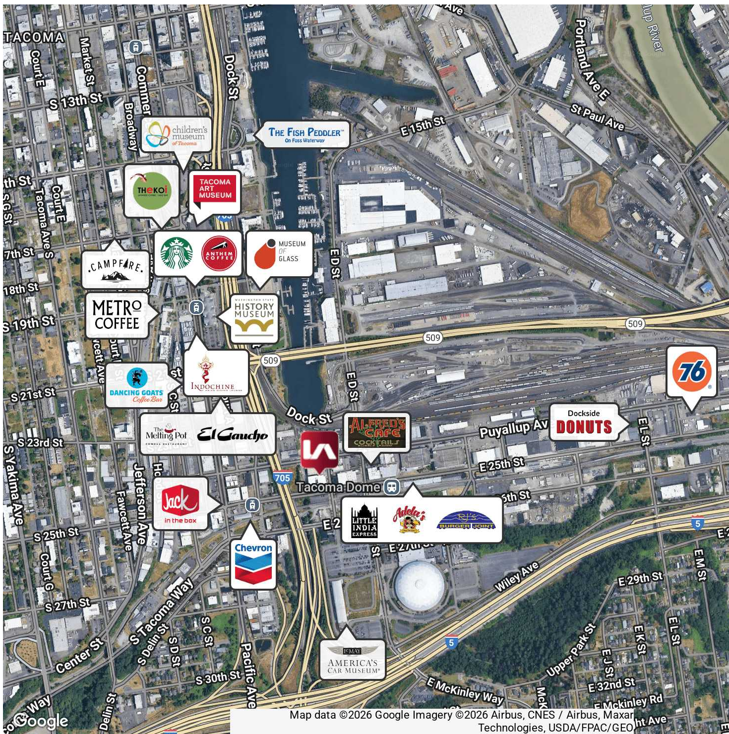
Map data ©2026 Google Imagery ©2026 Airbus, CNES / Airbus, Maxar Technologies, USDA/FPAC/GeoEye