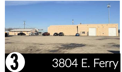
3 3804 E. Ferry