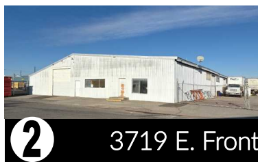
2 3719 E. Front