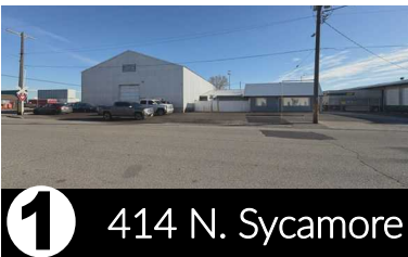
1 414 N. Sycamore