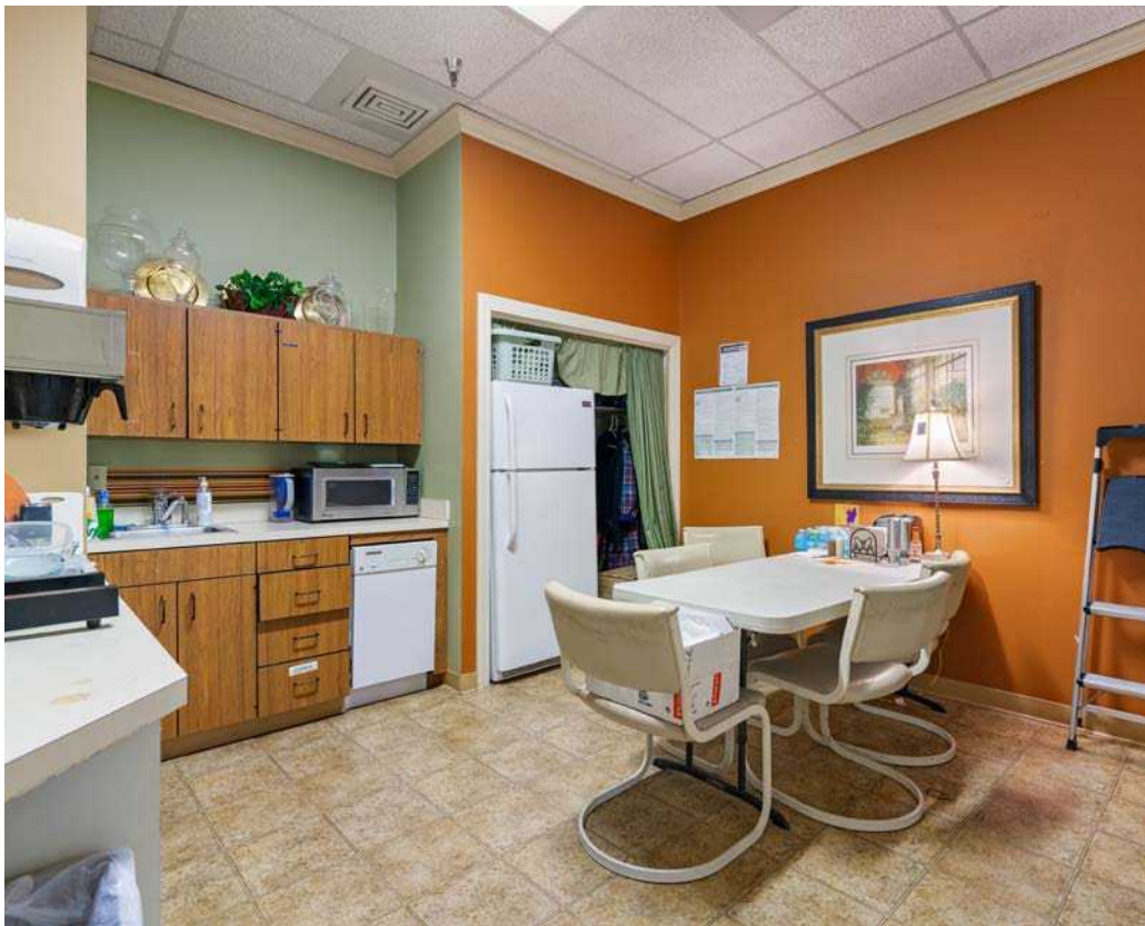
MAIN FLOOR - OFFICE