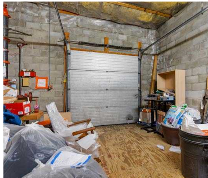
BASEMENT - SHOWROOM AND WAREHOUSE