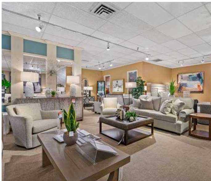
MAIN FLOOR - SHOWROOM