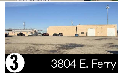
3 3804 E. Ferry