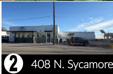
2 408 N. Sycamore