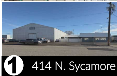
1 414 N. Sycamore