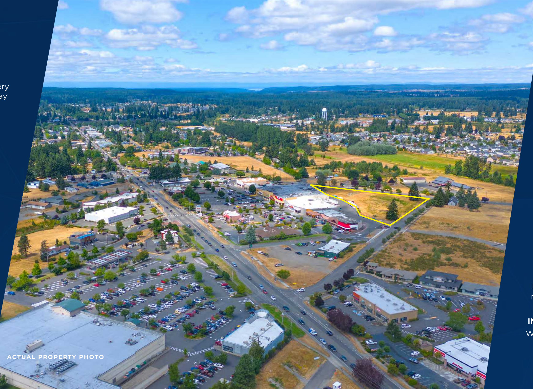
ACTUAL PROPERTY PHOTO

The Property benefits from all off-site utilities and infrastructure in-place allowing for a new development to come to fruition on an expedited timeframe.