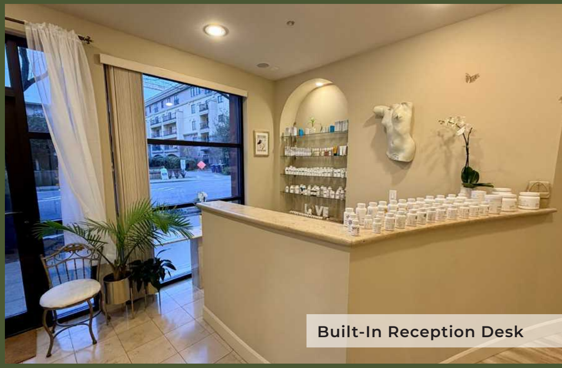
Built-In Reception Desk