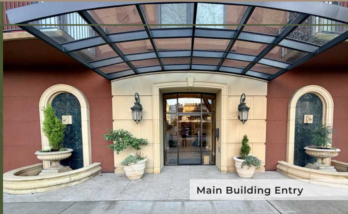
Main Building Entry