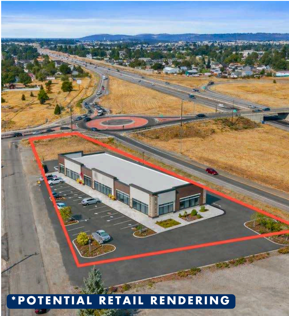
* POTENTIAL RETAIL RENDERING