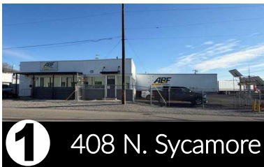
1 408 N. Sycamore