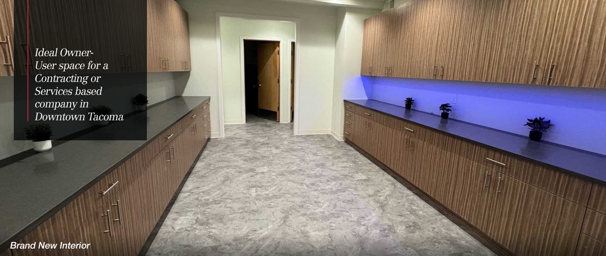
Brand New Interior

Ideal Owner-User space for a Contracting or Services based company in Downtown Tacoma