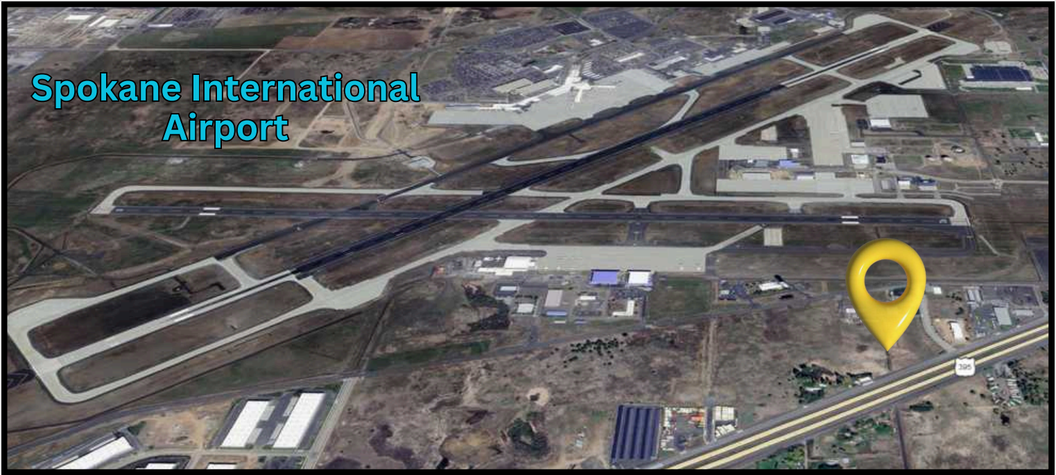
Spokane International Airport