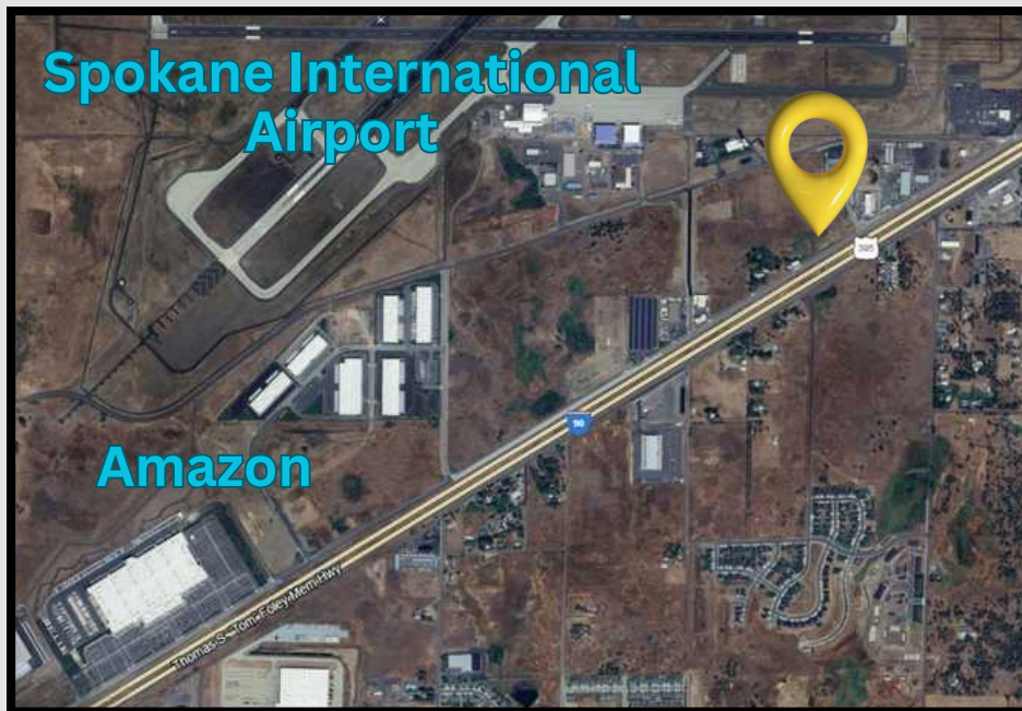
Spokane International Airport