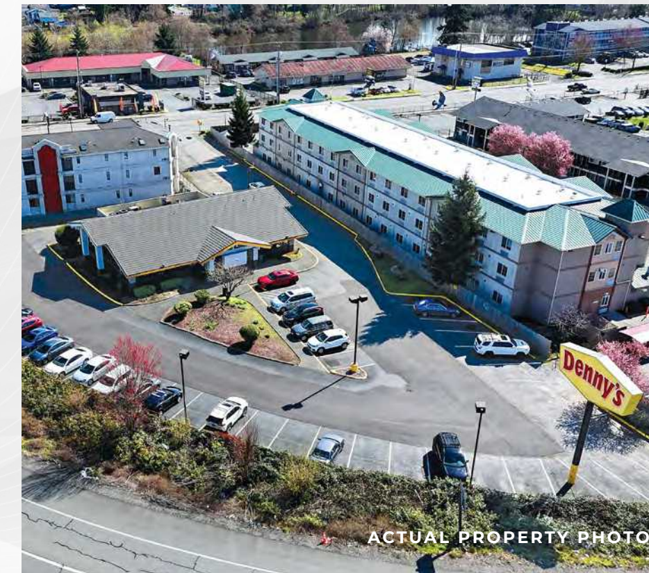
ACTUAL PROPERTY PHOTO