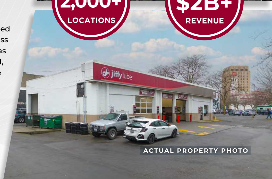
ACTUAL PROPERTY PHOTO