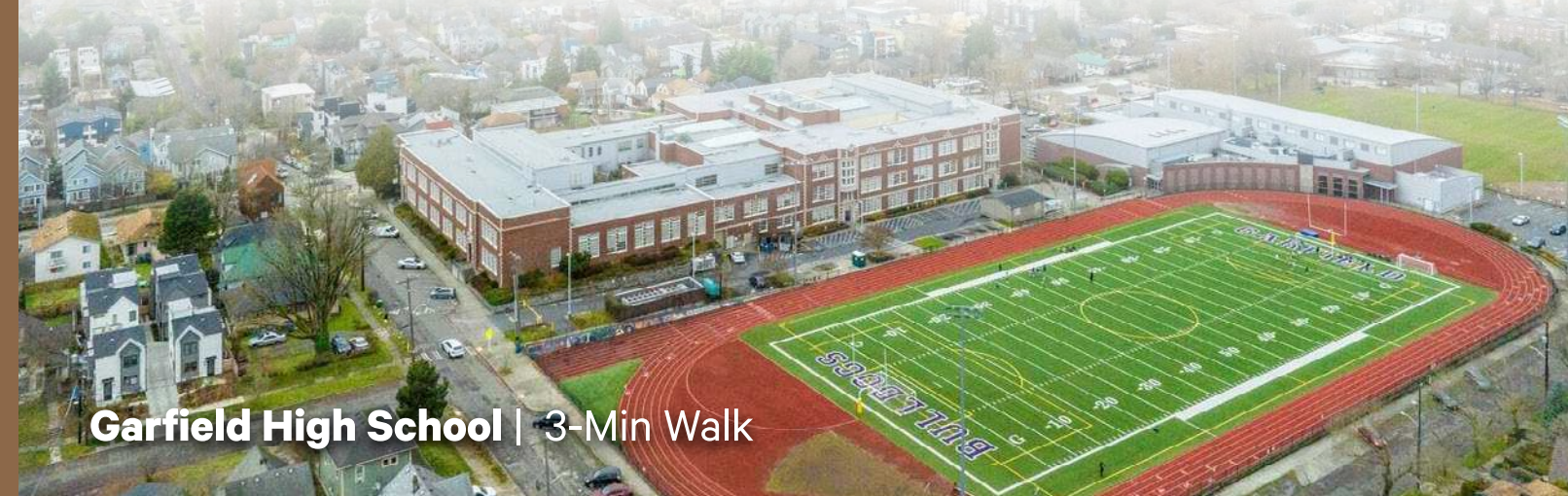
Garfield High School | 3-Min Walk

Caroline Apartments offers investors stable in-place income with upside potential in a high-demand rental market. Located just minutes from Downtown Seattle, Capitol Hill, and major employment hubs, the property enjoys exceptional walkability and transit access. The Central District continues to experience strong rental demand driven by its proximity to tech employers, cultural amenities, and neighborhood retail. This property's manageable scale, turnkey condition, and prime location make it an ideal investment for those seeking consistent cash flow and long-term appreciation in a core Seattle submarket.