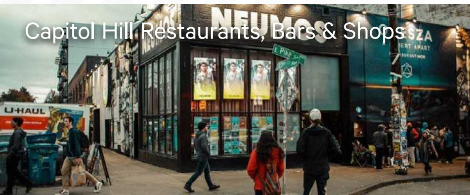
Capitol Hill Restaurants, Bars & Shops