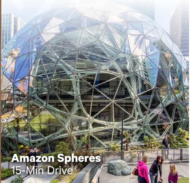
Amazon Spheres 15-Min Drive