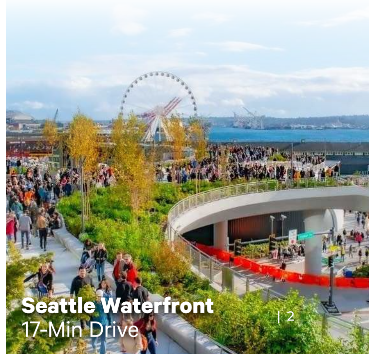
Seattle Waterfront 17-Min Drive