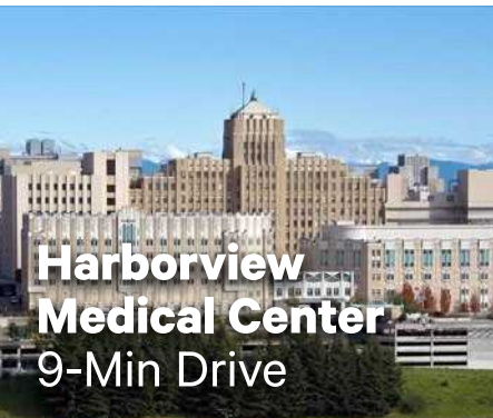
Harborview Medical Center 9-Min Drive

Excellent walkability to neighborhood retail, dining, parks, and public transit