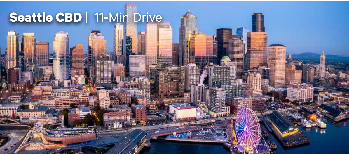
Seattle CBD | 11-Min Drive