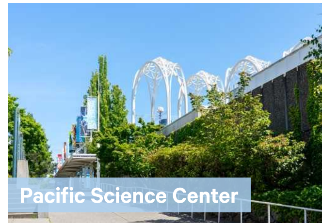
Pacific Science Center