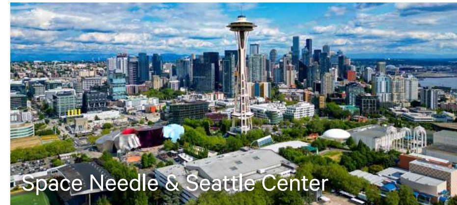
Space Needle & Seattle Center