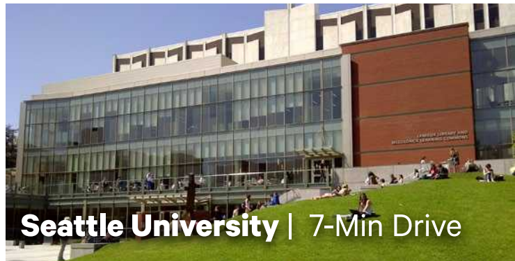
Seattle University | 7-Min Drive