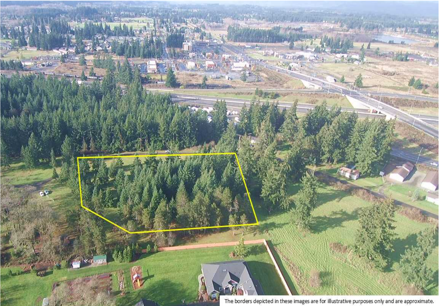
The borders depicted in these images are for illustrative purposes only and are approximate.