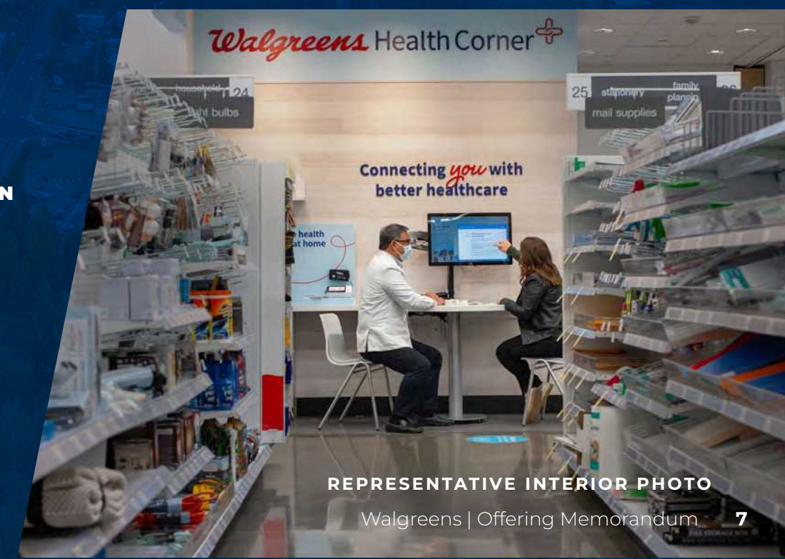
REPRESENTATIVE INTERIOR PHOTO