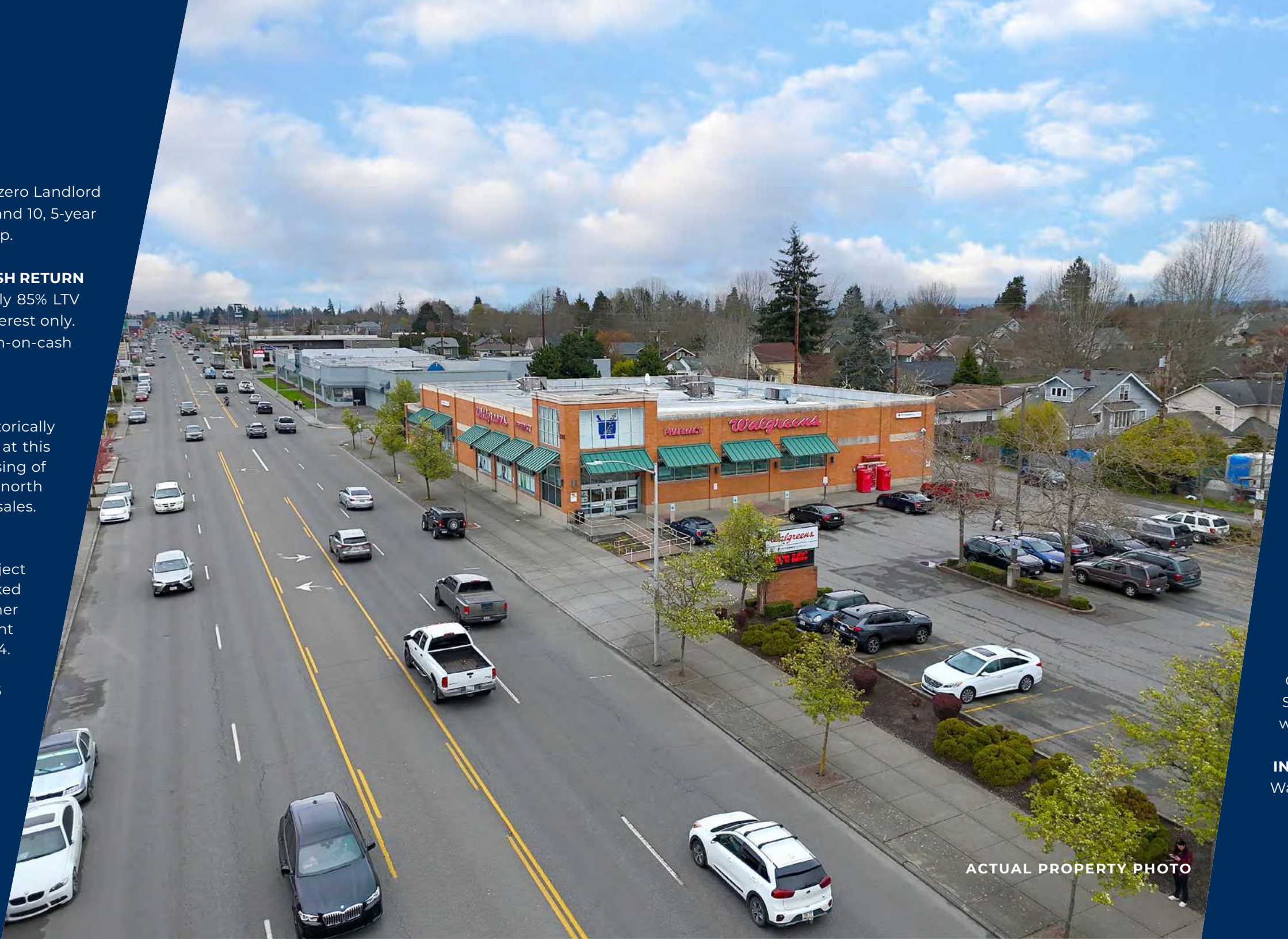
ACTUAL PROPERTY PHOTO

The Property is located on the corner of Broadway (21,100+ VPD) and 22nd St with additional access from (23rd St (4,700+ VPD), allowing for easy ingress/egress, excellent visibility and high-traffic counts.