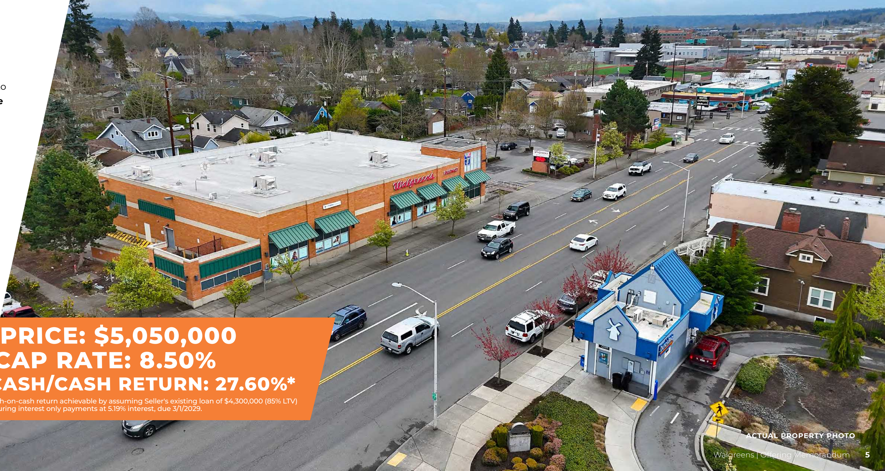
ACTUAL PROPERTY PHOTO

*Cash-on-cash return achievable by assuming Seller's existing loan of $4,300,000 (85% LTV) featuring interest only payments at 5.19% interest, due 3/1/2029.