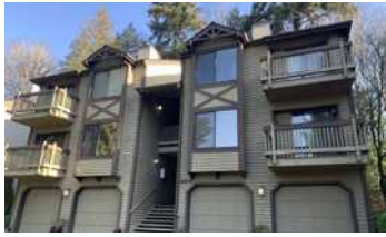
304 10TH ST, KIRKLAND