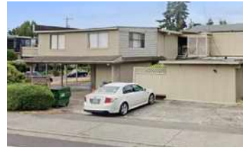
10150 NE 64TH ST, KIRKLAND