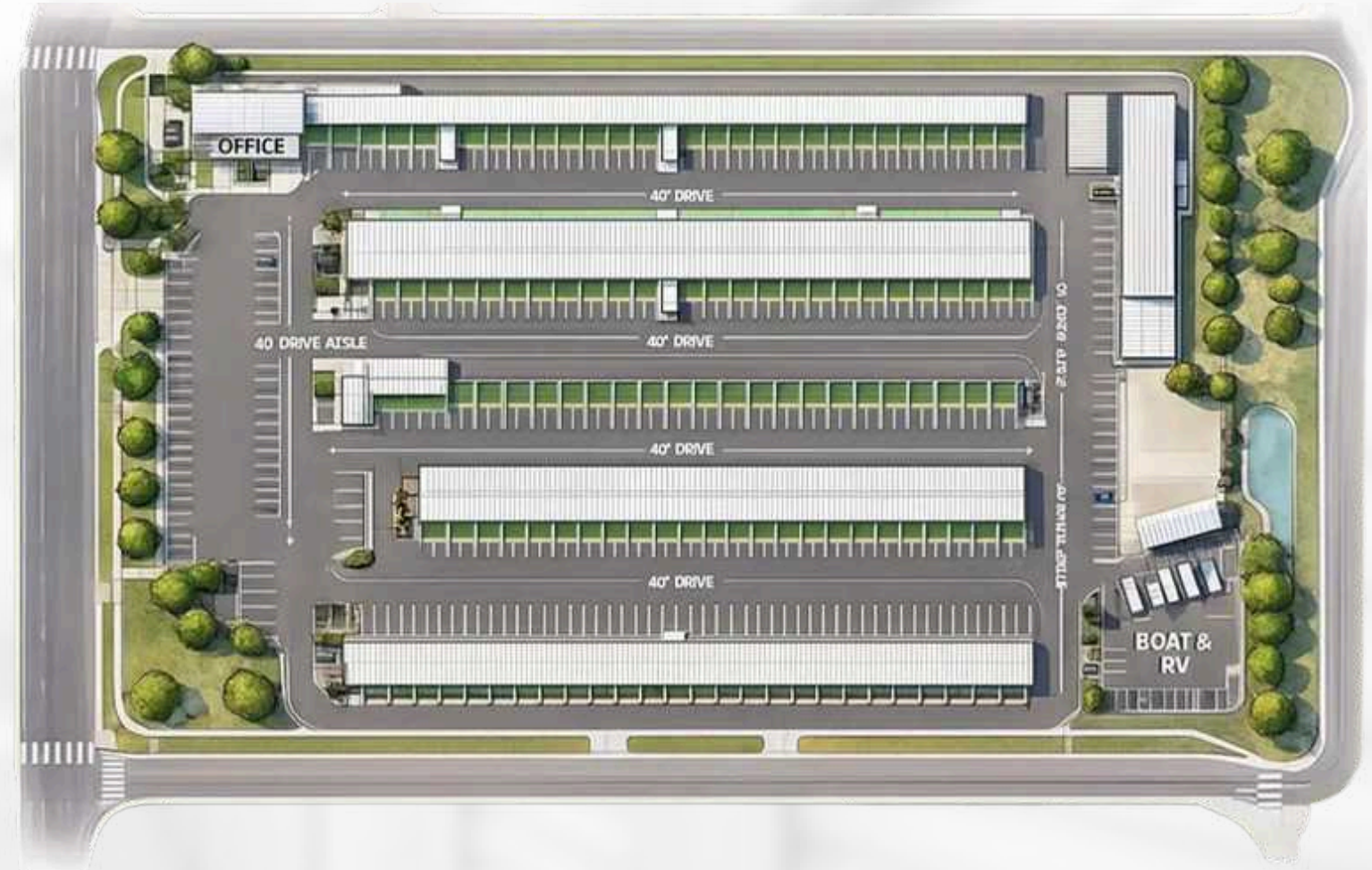
*A hypothetical rendering of a storage complex showcasing its potential design and layout* 45,000 SF Net Rentable (Using 3 of 6 Parcels)