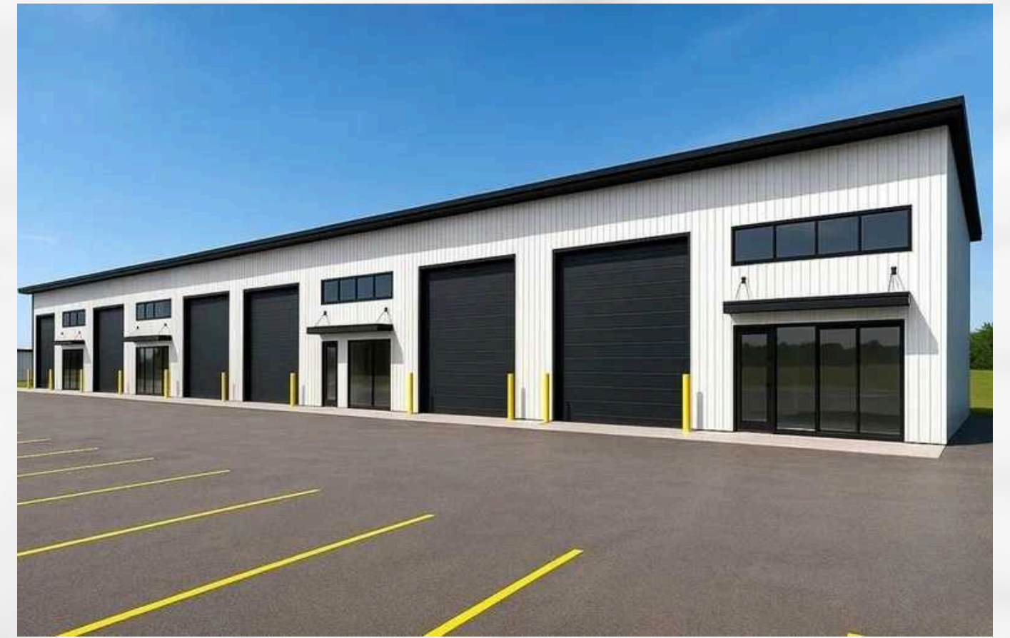
*A hypothetical rendering of a storage complex showcasing its potential design and layout*