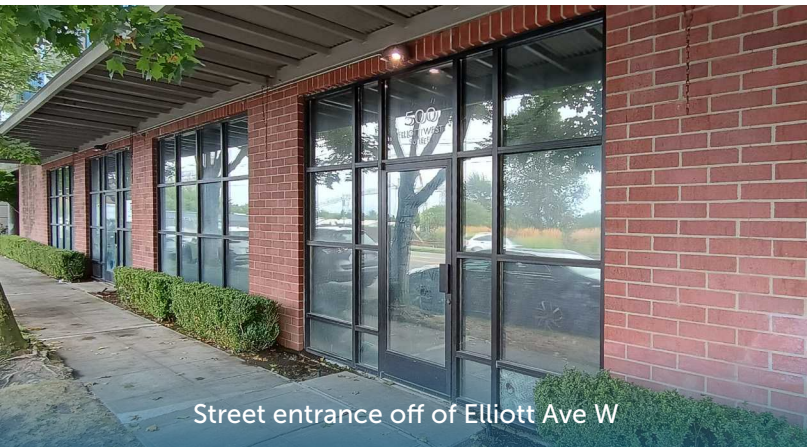
Street entrance off of Elliott Ave W