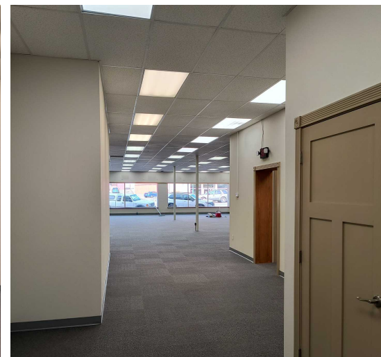
Hallway to Showroom