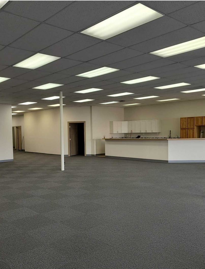
Showroom & Kitchen